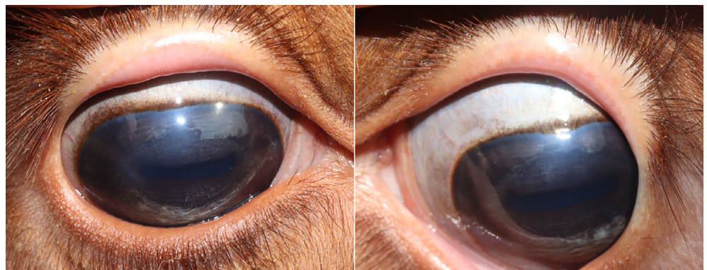
FIGURE 4 Appearance of the right and left eye at six months after surgery. The only abnormality noted consisted of a mild corneal haze with some dorsal ghost vessel

Although several techniques have been developed to treat distichiasis, a definitive gold standard method has not been well-established. A successful treatment decreases patient's symptoms, minimizes recurrence, and prevents ocular surface complications. 1,2,7 There are few reports in veterinary ophthalmology describing rates of surgical success. Partial tarsal plate excision by performing a perpendicular section of the lid margin or by