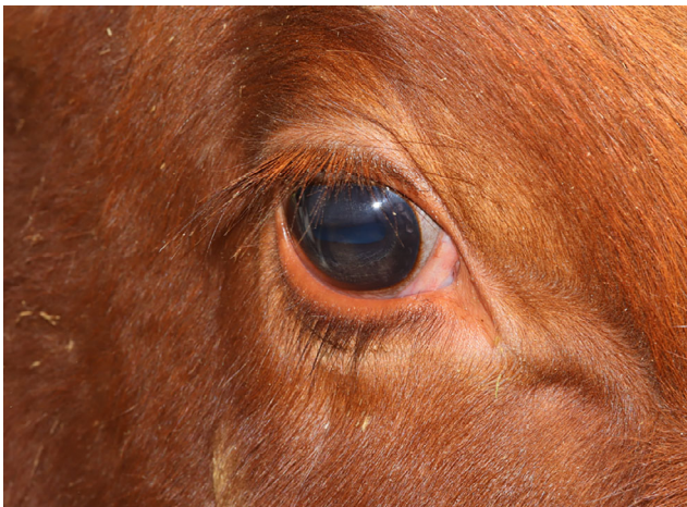
FIGURE 3 Appearance of the right eye at 14 days after surgery. Note the absence of epiphora

Immediate postoperative clinical appearance showed a mild blepharodema with the presence of a sero-hemorrhagic secretion derived from the openings of laserized Meibomian glands. No clinical signs of ocular pain were noted by the owner during the short-term period. Fourteen days postoperatively, the calf showed a very mild conjunctival eyelid hyperemia and a minimal