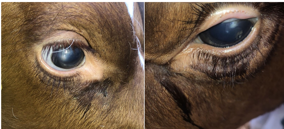
FIGURE 1 Appearance of the right and left eye at the first examination. Note the marked bilateral epiphora and the chronic corneal lesions due to irritation by multiple distichiae